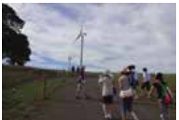
Study Tour in Australia "Creating a Sustainable Society" (Spring 2013)