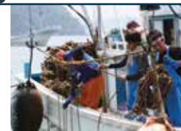
Cleaning Coastal Areas and Assisting Fishing Communities (19 areas)