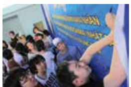
International Exchange Program in Asia (Summer 2011)

PBV has coordinated speakers in: Italy, India, Australia, The Republic of Korea, Greece, Jamaica, Switzerland, Sweden, Spain, Germany, The Dominican Republic, Turkey, Brazil, France, Vietnam, Venezuela & Mexico.