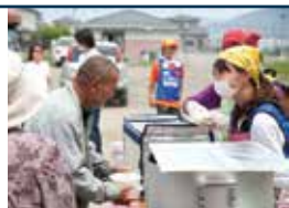
Hot Meal Provision and Other Relief Supplies (107,835 meals / 1,800T supplies)