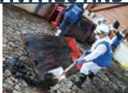
Clearing Homes and Shops of Mud/Debris (2,141 structures)