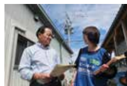
Kizuna Newsletter – Providing Psychosocial Care (Refer to p. 5)