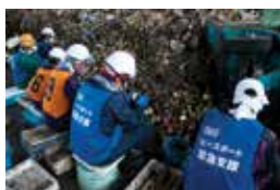
Revitalization of Local Industries and Livelihoods (Since June 2011)