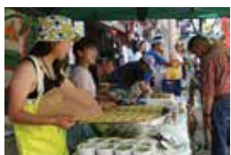
Community Building (Refer to p.4)