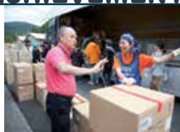
Distribution of Supplies to Temporary Housing Residents (For 1,320 households)