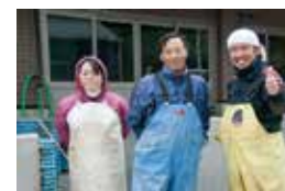
Imacoco Project – Supporting Local Fishing Communities (Refer to p.5)