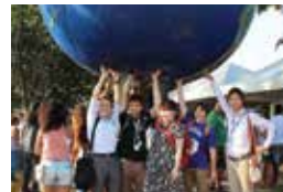
Rio + 20, Earth Summit (Rio de Janeiro, 2012)