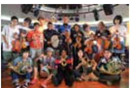
Fukushima x Venezuela x Los Angeles Music Exchange (Summer 2012)