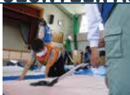
Evacuation Center Support (Cleaning/Bathing Facilities at 60 locations)