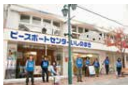
Community Center Management (11,356 visitors)