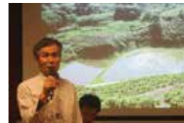
Global Platform for Disaster Risk Reduction (Geneva, 2013)